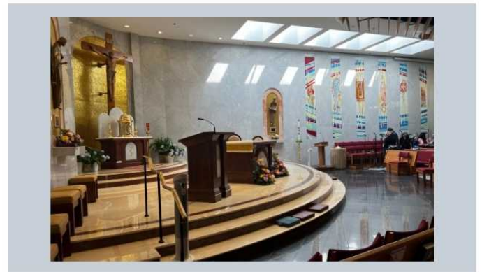
New Altar and Seven Corporal Works of Mercy Mosaic