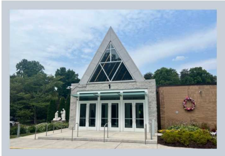
Nativity Catholic Church, Burke VA